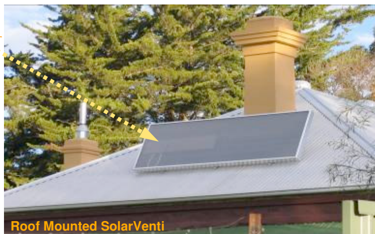
Roof Mounted SolarVenti

SV7-SV30 systems may be supplied with a thermostat controlled cooling kit which powers a fan when required. At a selected temperature, the cooling fan removes warm air from the room or alternatively the fan may supply cooler air from below the house or through ducts buried in the ground.