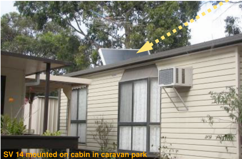
SV 14 mounted on cabin in caravan park