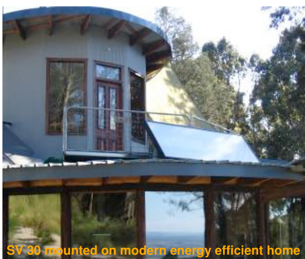
SV 30 mounted on modern energy efficient home

- the solar powered warm, fresh air producer