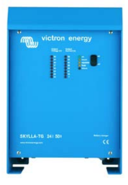
Skylla TG 24 50