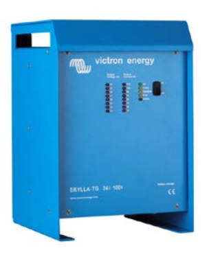
Skylla TG 24 100