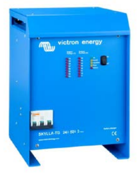
Skylla TG 24 50 3 phase